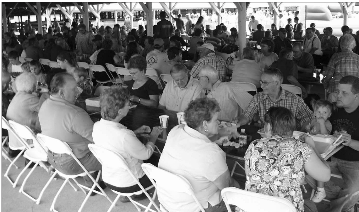
The tables stayed full as members enjoyed the free meal, popcorn and sodas.