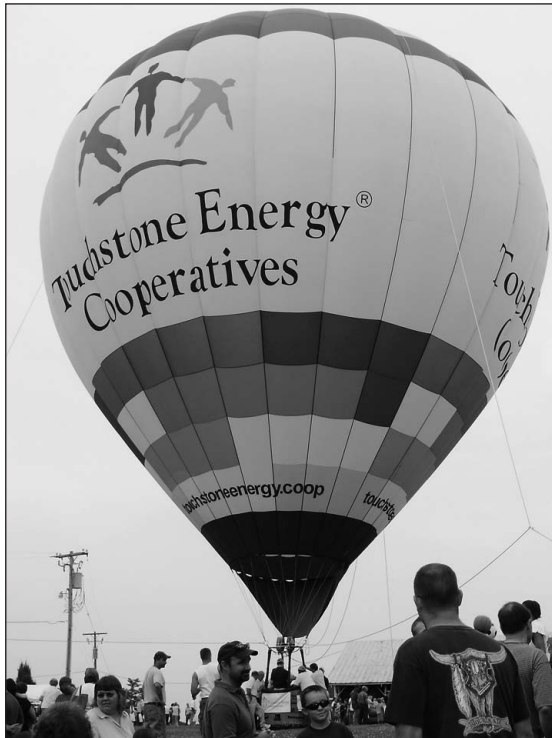
The Touchstone Energy balloon is always a crowd favorite.