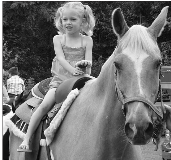
Horse and pony rides were provided by the Perry County 4-H Horse and Pony Club.